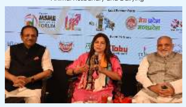
Smt. Meenakshi Lekhi, Minister of State for External Affairs and Culture