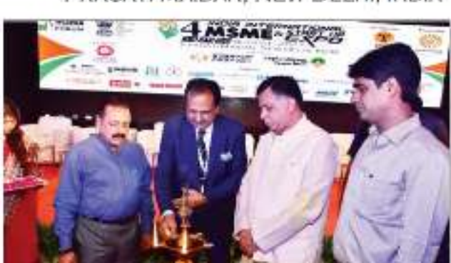
On Mondor Singh Union Minister (MOS), Prime Ministers Office (PMO), Sh. Satish Mahana, Industry Minister, UP Sh. Rajnish Gwenka, Chairman of MSME - DF Inaugurating 4th Expo