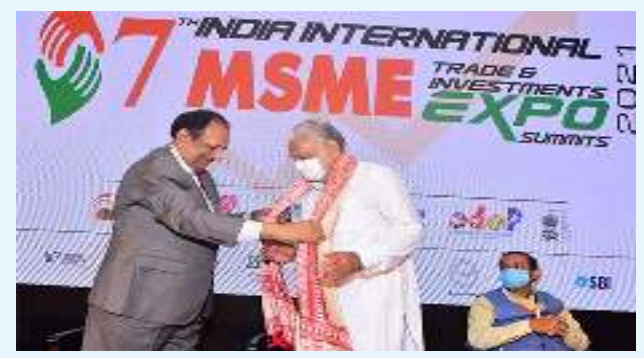
Shri Parshottam Rupala, Minister of Fisheries, Animal Husbandry and Dairying