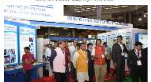
Shri Ravi Shankar Prashad, Union Electronic & IT Minister