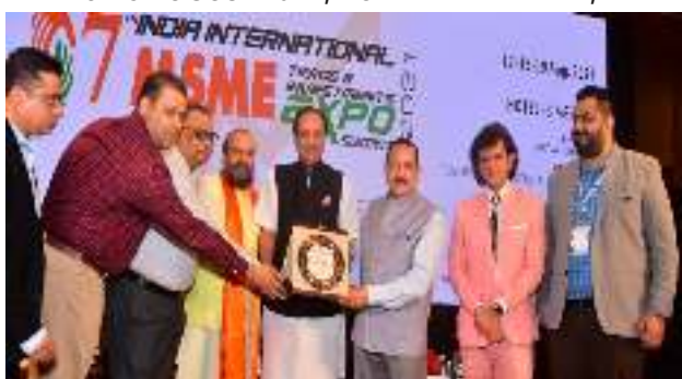
Dr. Jitender Singh Union Minister (MOS) Prime Ministers Office (PMO)