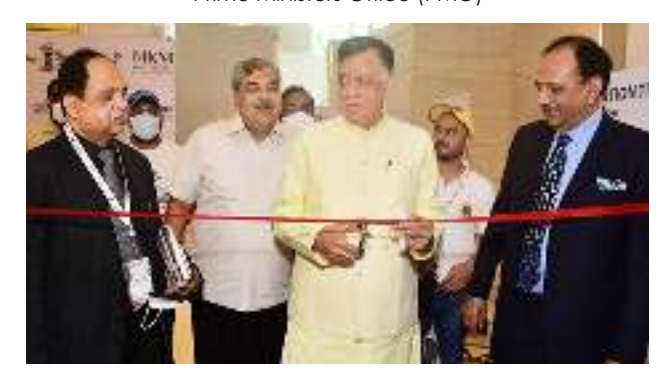
Sh. Satish Mahana, Industry Minister, U.P.