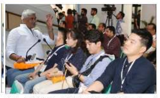
Sh. Gajendra Singh Shekkawat, Union Cabinet Minister of Jal Shekti (Water Kessunors) With Foreign Delegates, delivering Keynote address on apportunities in Water Resources Management in India