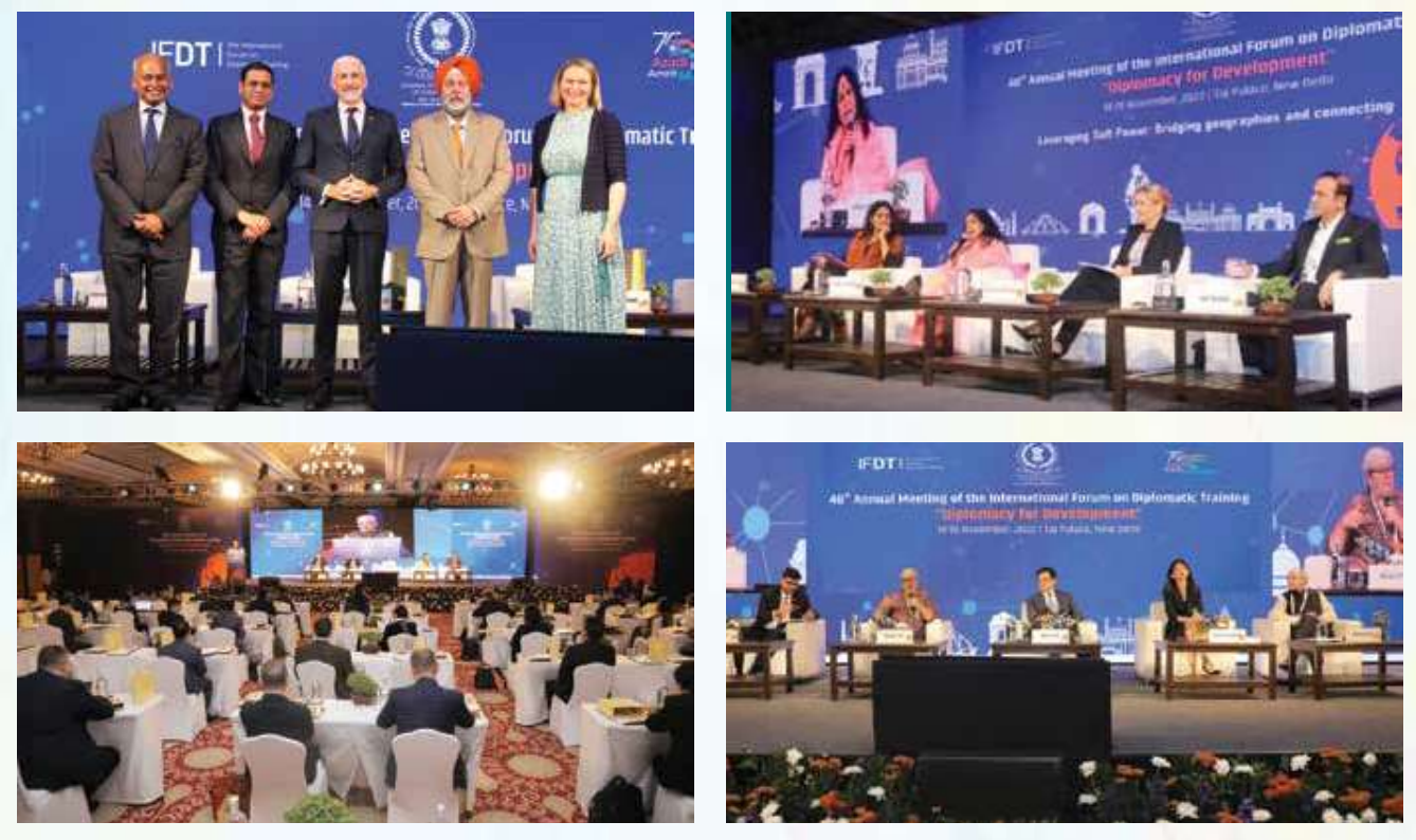
Panel discussions with the participation of eminent scholars and think-tanks