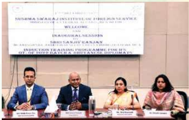
Welcome address by Dean (SSIFS)