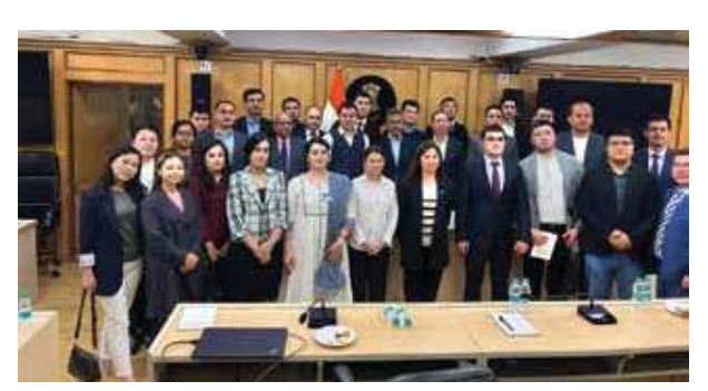
Visit to Election Commission of India