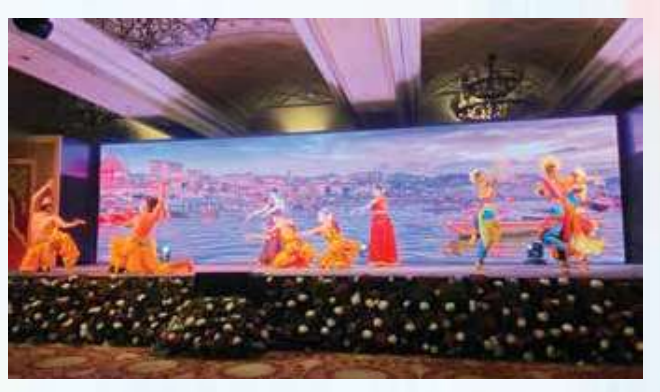
Cultural programme showcasing folk dances of India