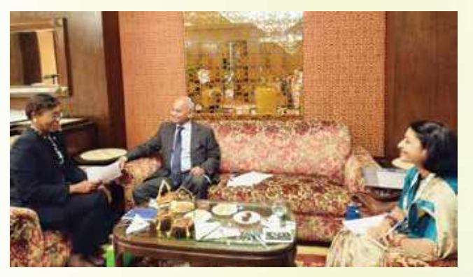
Dean (SSIFS)'s meeting with Permanent Secretary, MFA, Jamaica