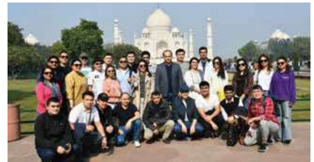
Visit to Taj Mahal, Agra