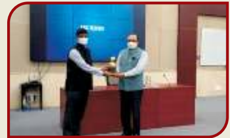
IFS OTs handing over insignias to Dean (SSIFS) which were received during their Army Attachment