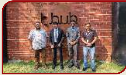
IFS OTs calling on Indian dignitaries (Governors, Chief Ministers and senior officials) and visits to the projects/facilities of Indian States as part of their State Attachment