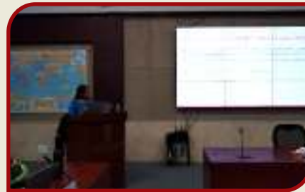
Presentation of thesis by IFS OTs