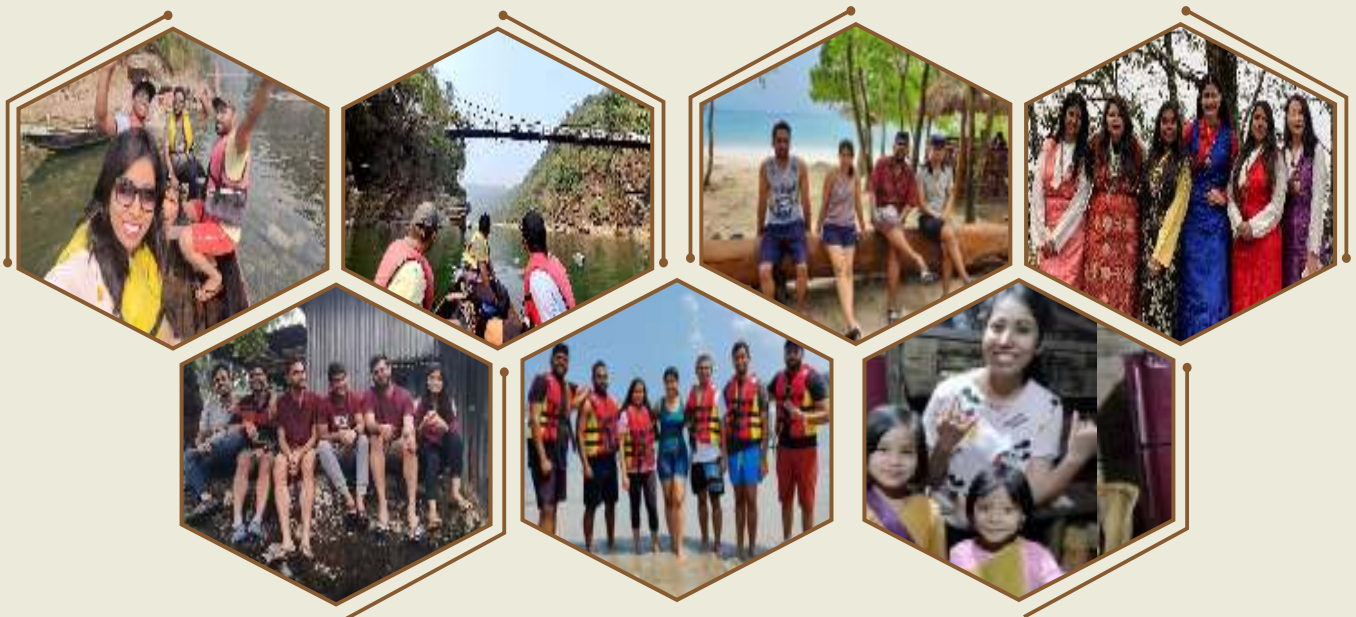
IFS OTs' visit to Andamans, Sikkim, Kolkata, Puducherry & Hyderabad as part of their Bharat Darshan tour