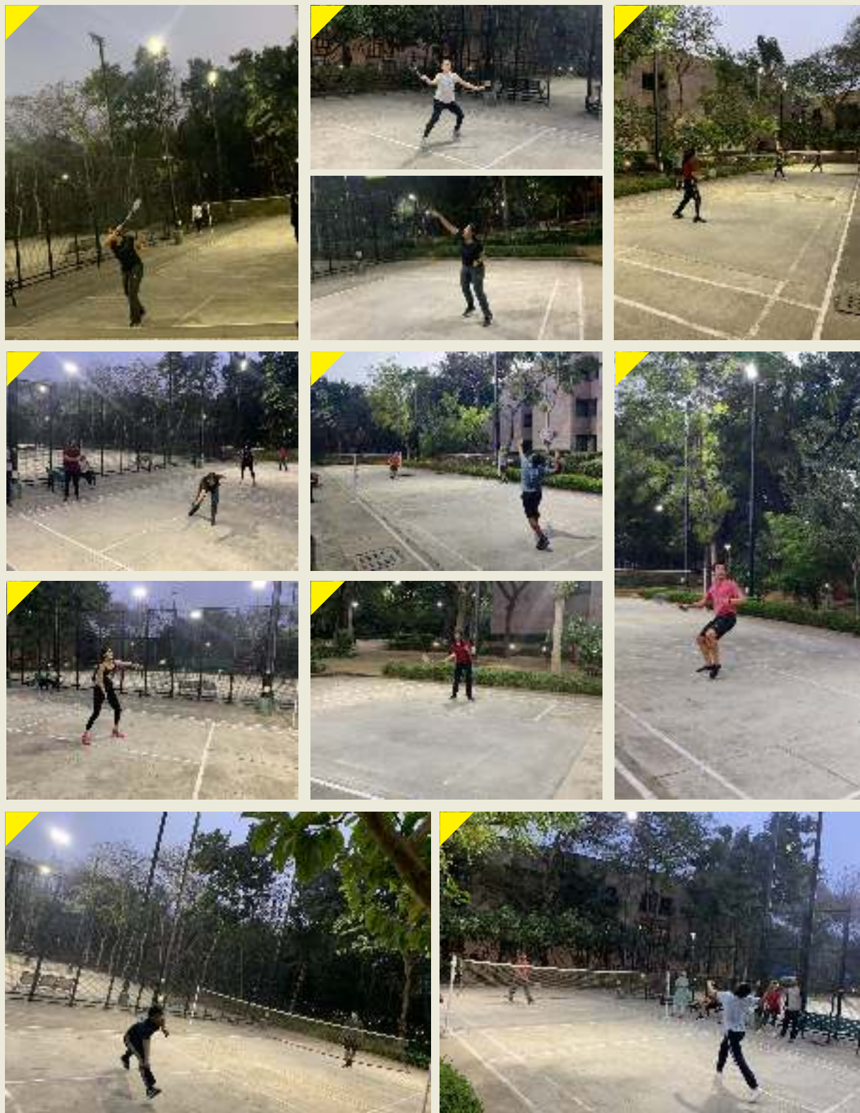
IFS OTs' sports activities at SSIFS Campus