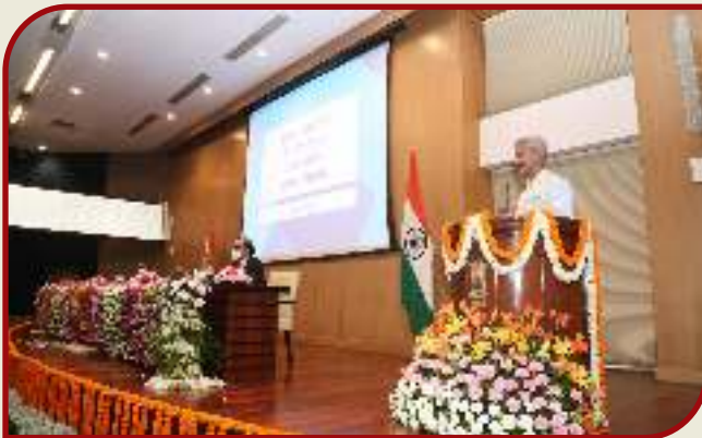
EAM addressing the IFS OTs

A valedictory ceremony was organized on 08 June 2021, which was presided over by Dr. S. Jaishankar, Hon'ble External Affairs Minister (EAM) as Chief Guest. Shri V. Muraleedharan, Hon'ble Minister of State for External Affairs (MoS) participated as Guest of Honour. Awards were given on the occasion to deserving OTs of the 2020 batch.