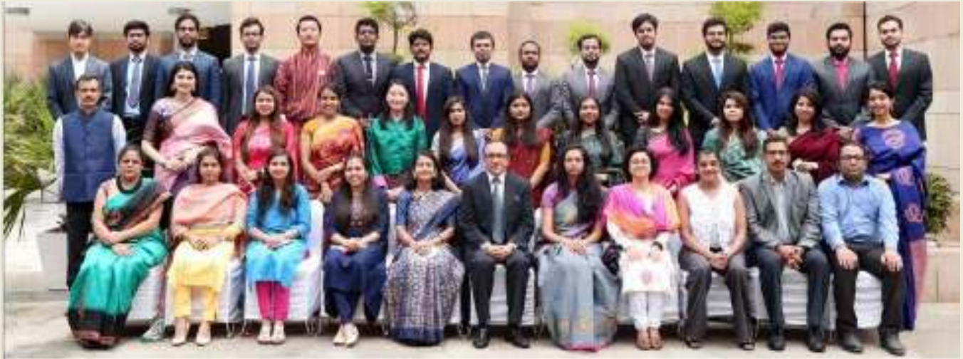
SSIFS Faculty, IFS OTs 2020 Batch & Bhutanese Diplomats