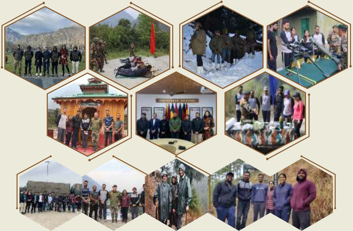
IFS OTs' visit to Bagdogra, Dibrugarh and Srinagar as part of their Army attachment